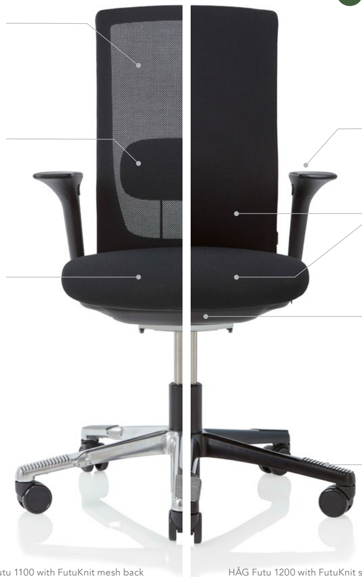
HÅG Futu 1100 with FutuKnit mesh back

7 appealing colours Select from seven matching fabrics and mesh colours – FutuKnit mesh (back) and FutuKnit solid (seat and back).